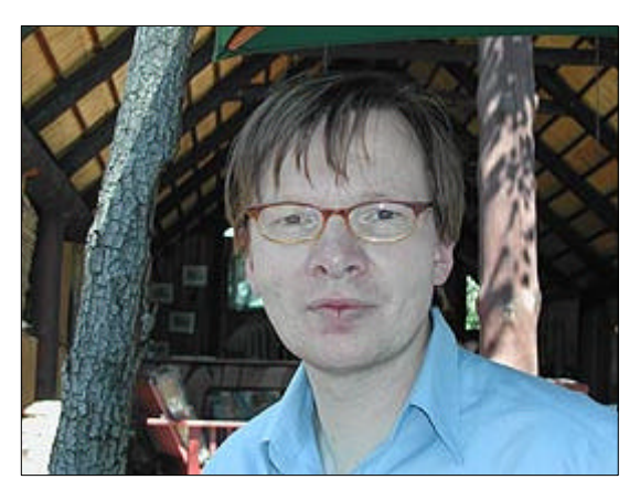
projects fruitfully undertaken. 11