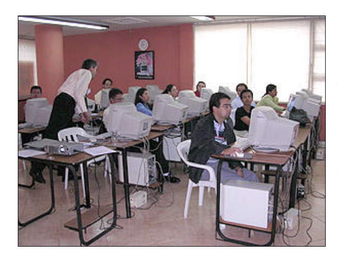
Site administrators from four "transparent municipalities" receive a joint training by Colnodo