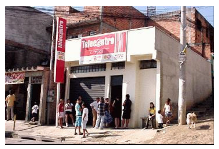
Locals queue up to use the community telecentre in the Campos neighbourhood of São Paulo.

On 2 September, RITS signed an agreement with the Municipality of São Paulo to set up and manage more than 100 telecentres in marginal areas of Brazil's largest city. The initiative involves RITS developing special programmes, training telecentre personnel and guaranteeing maintenance. Most of the telecentres are located in poor neighbourhoods that have traditionally suffered from high levels of crime and violence. Each centre has 20 machines hooked up to the Internet, which can be used free of charge by the local community. Support staff orientate and assist users.