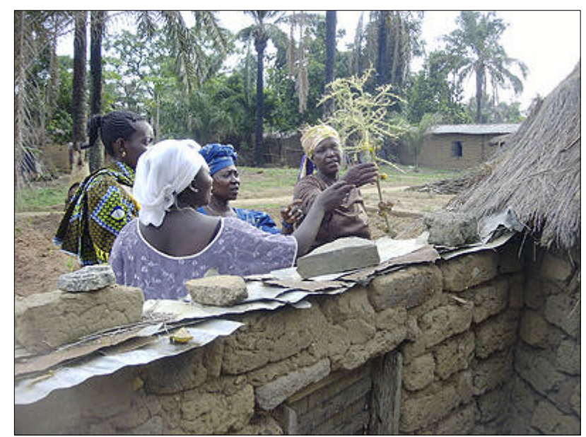
Electronic documenting of traditional health knowledge in local communities relies on oral means of information capture

The project is a first attempt at documenting traditional health knowledge and skills in local communities that traditionally rely on oral means of information capture. The communities, especially the older members, generate all the information held in the electronic catalogue, and the knowledge remains the property of the communities. A medical database is under