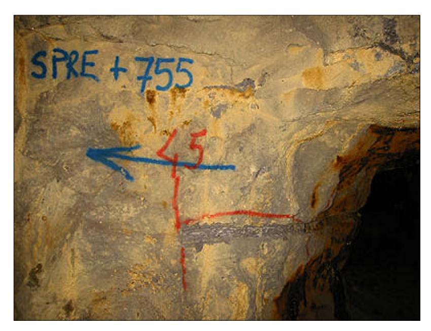
Destructive geological sampling by Rosia Montana Gold Corporation

Count – was originally to have been built in a treasured medieval town, declared a World Heritage site by UNESCO.<sup>87</sup> As a direct result of NGO efforts – many coordinated on the