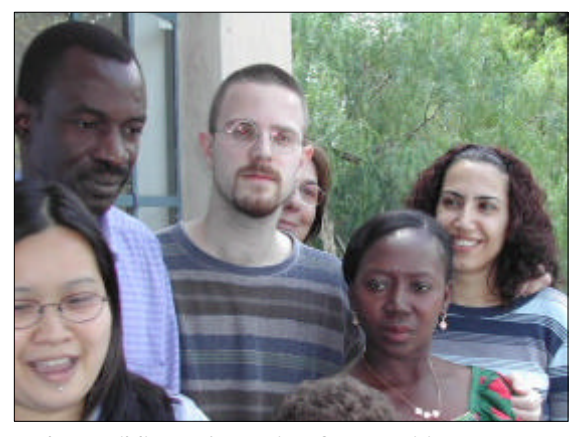
The "Building Information Communities workshop brought together 26 information specialists from around the world including Senegal, Hungary, Uruguay, Jordan, Nigeria and the Philippines.

Building on the needs expressed by APC members and partners using the Internet to promote development and social justice in an online consultation undertaken in early 2001, APC brought together 26 information specialists from around the world to a workshop in South Africa to strengthen the information community within and beyond APC, and identify and develop resources to promote effective online content work.