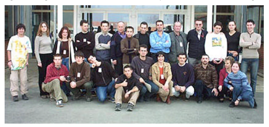
Environmental, youth and women's groups in Kosova meet for a second workshop on how to use the Internet strategically

Kosova<sup>71</sup> became the centre of a violent conflict after the regime of Slobodan Milosevic removed the province's autonomy in 1989. After a decade of violence, ethnic cleansing and guerrilla war, the conflict came to a head following an armed air-strikes operation by NATO against Yugoslavia, which led to the collapse of Milosevic and his government. Since then,