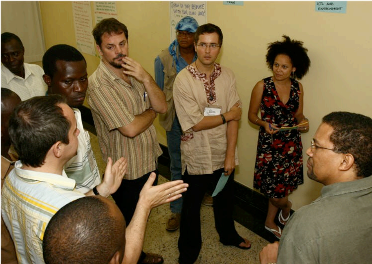
Representatives from Colombia, UK, Cameroon, Canada, Nigeria and South Africa discuss the future APC priorities.